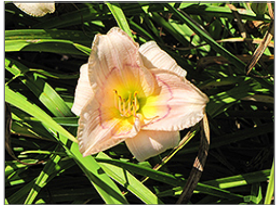
Siloam David Kirchhoff Daylily flowers