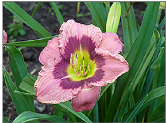
Siloam Jim Cooper Daylily flowers