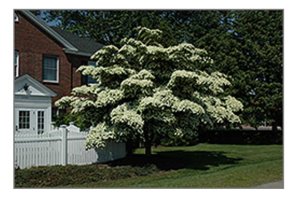
Chinese Dogwood in bloom

This is a relatively low maintenance tree, and should only be pruned after flowering to avoid removing any of the current season's flowers. It is a good choice for attracting birds to your yard. It has no significant negative characteristics.