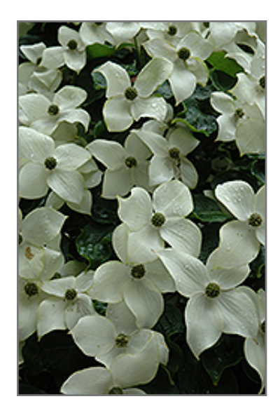
Chinese Dogwood flowers