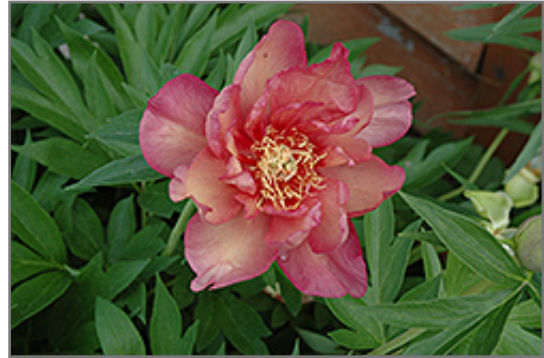
Kopper Kettle Peony flowers