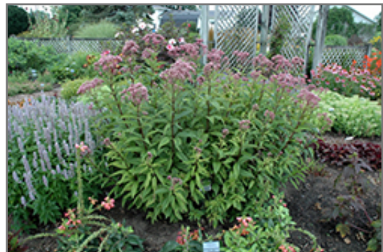
Baby Joe Dwarf Joe Pye Weed in bloom