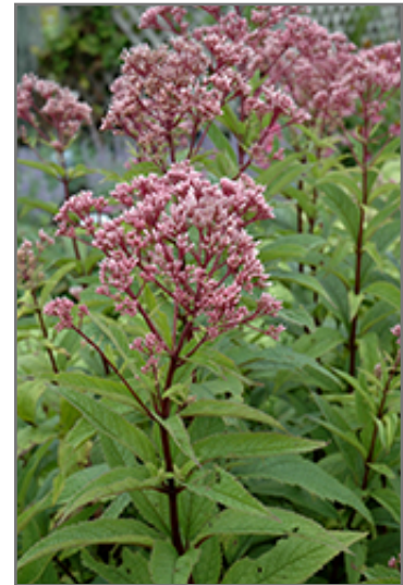
Baby Joe Dwarf Joe Pye Weed flowers

Baby Joe Dwarf Joe Pye Weed is recommended for the following landscape applications;