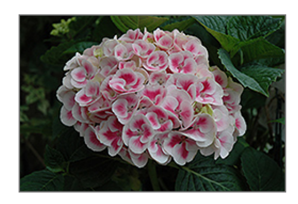
Cityline Mars Hydrangea flowers