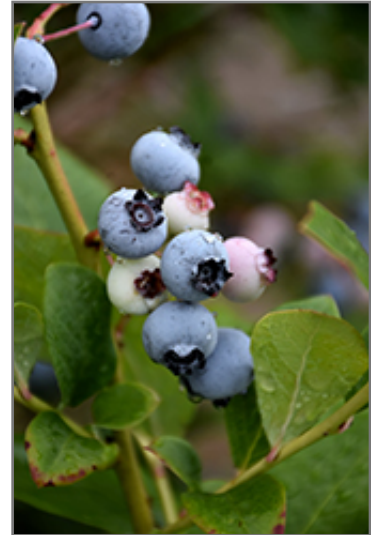
Spartan Blueberry fruit

This is a multi-stemmed deciduous shrub with an upright spreading habit of growth. Its average texture blends into the landscape, but can be balanced by one or two finer or coarser trees or shrubs for an effective composition. This is a relatively low maintenance plant, and usually looks its best without pruning, although it will tolerate pruning. It is a good choice for attracting birds to your yard. It has no significant negative characteristics.