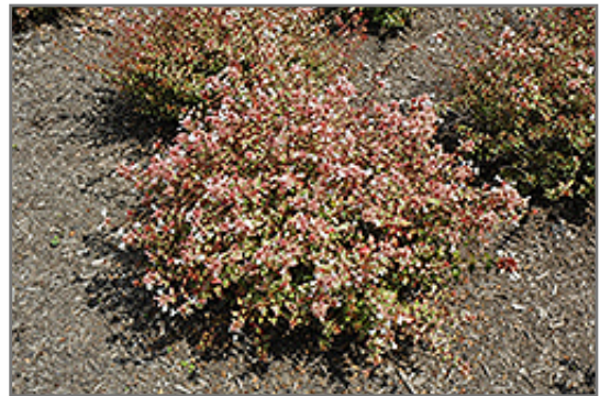
Sunshine Daydream Abelia in bloom