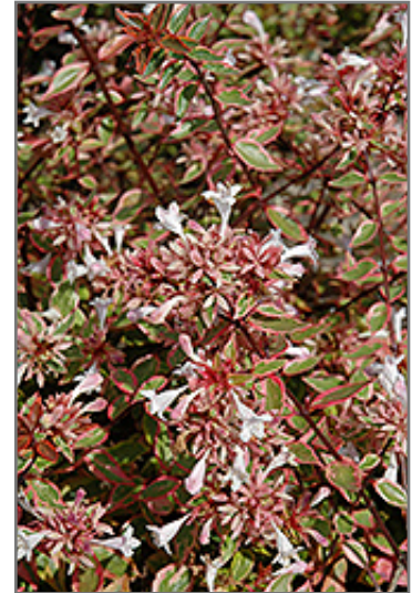
Sunshine Daydream Abelia flowers

Sunshine Daydream Abelia is recommended for the following landscape applications;