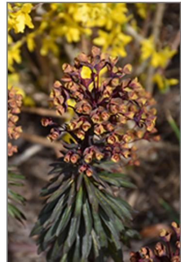
Purple Wood Spurge flower buds