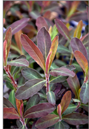
Purple Wood Spurge foliage

Purple Wood Spurge is a fine choice for the garden, but it is also a good selection for planting in outdoor pots and containers. It is often used as a 'filler' in the 'spiller-thriller-filler' container combination, providing a mass of flowers and foliage against which the thriller plants stand out. Note that when growing plants in outdoor containers and baskets, they may require more frequent waterings than they would in the yard or garden.