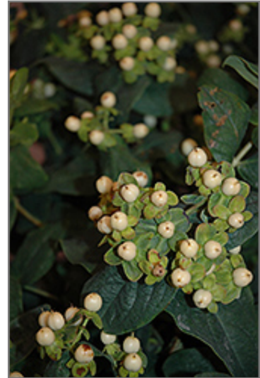
First Editions White St. John's Wort fruit

First Editions White St. John's Wort will grow to be about 3 feet tall at maturity, with a spread of 3 feet. It tends to fill out right to the ground and therefore doesn't necessarily require facer plants in front. It grows at a medium rate, and under ideal conditions can be expected to live for approximately 5 years.