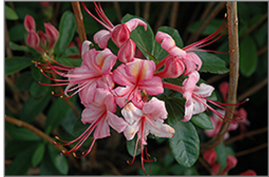
Pink And Sweet Azalea flowers

Pink And Sweet Azalea will grow to be about 4 feet tall at maturity, with a spread of 4 feet. It tends to be a little leggy, with a typical clearance of 1 foot from the ground. It grows at a slow rate, and under ideal conditions can be expected to live for 40 years or more.