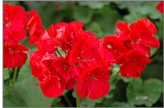
Sassy Dark Red Geranium flowers