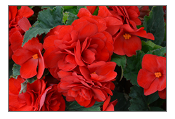
Nonstop Deep Red Begonia flowers