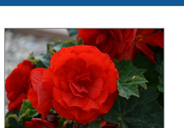
Nonstop Deep Red Begonia flowers

Nonstop Deep Red Begonia is recommended for the following landscape applications;