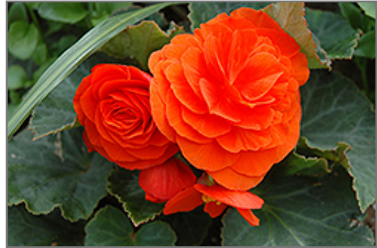
Nonstop Golden Orange Begonia flowers

Nonstop Golden Orange Begonia is recommended for the following landscape applications;