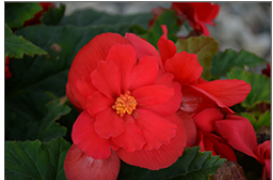
Nonstop Red Begonia flowers