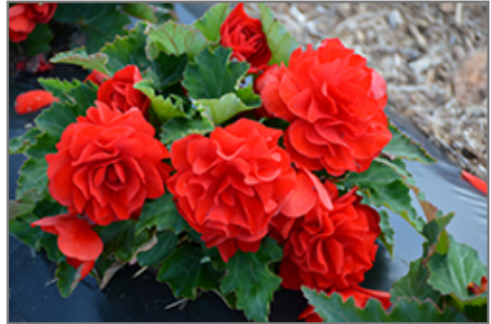
Nonstop Red Begonia in bloom

Nonstop Red Begonia is recommended for the following landscape applications;