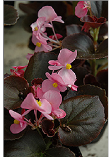
Cocktail Gin Begonia flowers