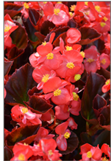
Cocktail Vodka Begonia flowers

Cocktail Vodka Begonia is recommended for the following landscape applications;