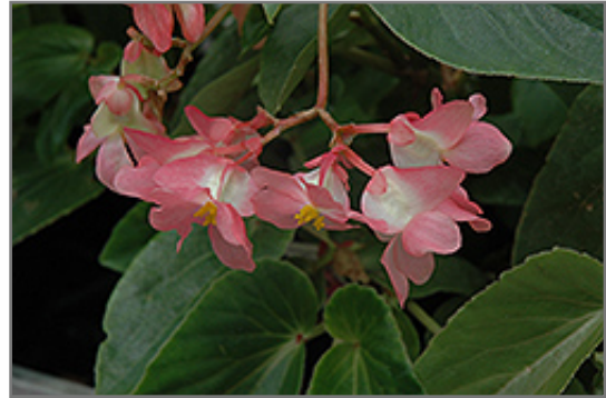
Dragon Wing Pink Begonia flowers

Dragon Wing Pink Begonia is recommended for the following landscape applications;