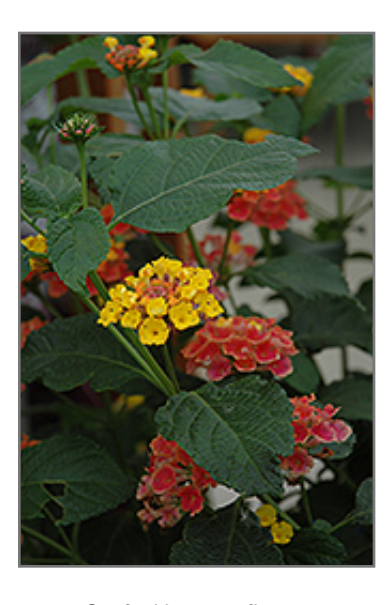
Confetti Lantana flowers