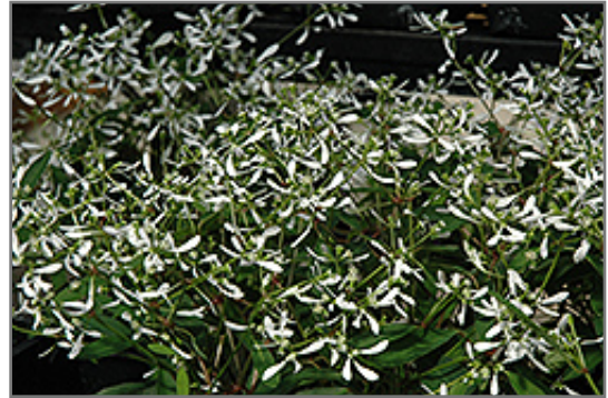
Silver Fog Euphorbia flowers