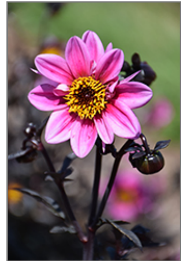
Mystic Dreamer Dahlia flowers