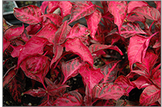
Grenadine Alternanthera foliage