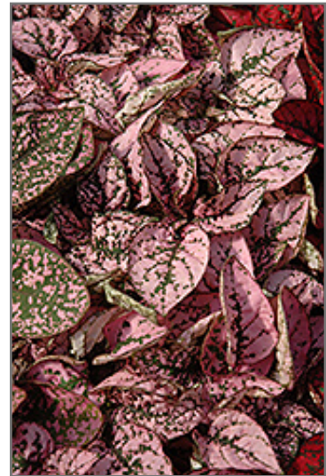
Splash Select Pink Polka Dot Plant foliage