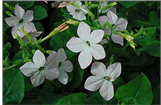
Hummingbird Appleblossom Tobacco flowers