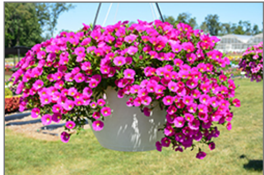
Noa Dark Pink Carnival Calibrachoa in bloom