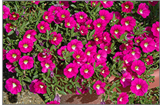
Noa Dark Pink Carnival Calibrachoa flowers

Noa Dark Pink Carnival Calibrachoa is recommended for the following landscape applications;