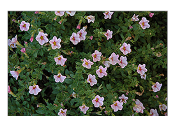
Superbells Cherry Blossom Calibrachoa flowers