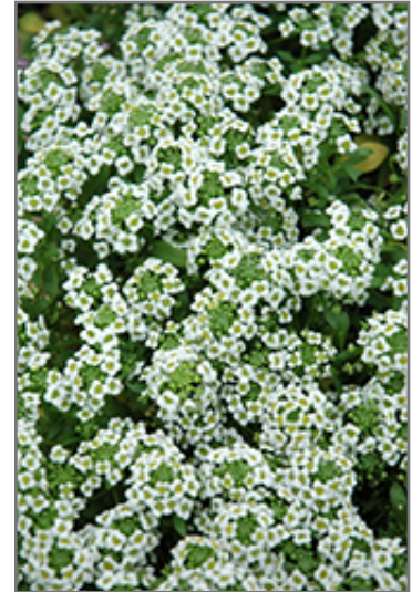
Clear Crystal White Sweet Alyssum flowers

Clear Crystal White Sweet Alyssum is recommended for the following landscape applications;