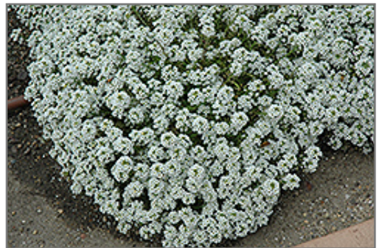
Clear Crystal White Sweet Alyssum in bloom