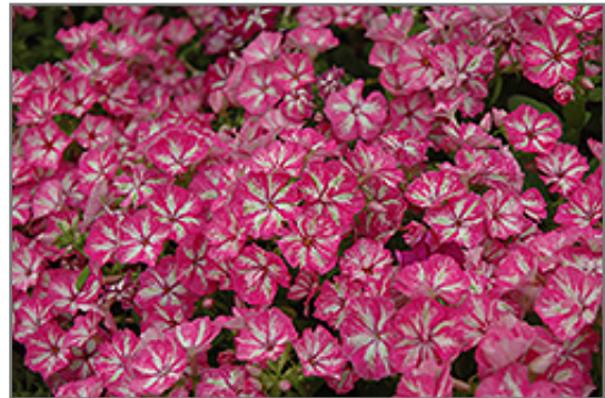
Grammy Pink and White Annual Phlox flowers

Grammy Pink and White Annual Phlox will grow to be about 10 inches tall at maturity, with a spread of 10 inches. When grown in masses or used as a bedding plant, individual plants should be spaced approximately 8 inches apart. Its foliage tends to remain low and dense right to the ground. This fast-growing annual will normally live for one full growing season, needing replacement the following year.