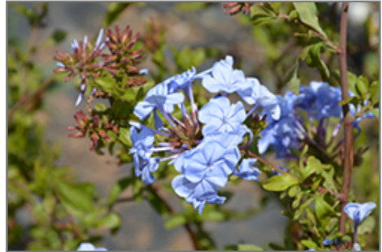
Imperial Blue Plumbago flowers

Imperial Blue Plumbago is recommended for the following landscape applications;