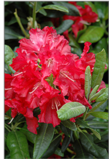
War Dance Rhododendron flowers

War Dance Rhododendron will grow to be about 6 feet tall at maturity, with a spread of 6 feet. It tends to be a little leggy, with a typical clearance of 1 foot from the ground, and is suitable for planting under power lines. It grows at a slow rate, and under ideal conditions can be expected to live for 40 years or more.