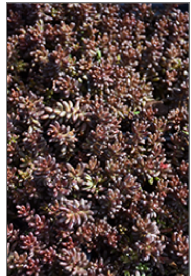
Murale Stonecrop foliage