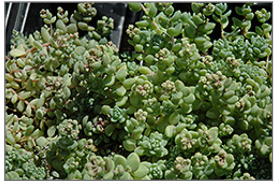
Corsican Stonecrop foliage

Corsican Stonecrop is recommended for the following landscape applications;