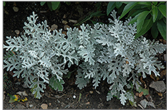
Silver Dust Dusty Miller foliage