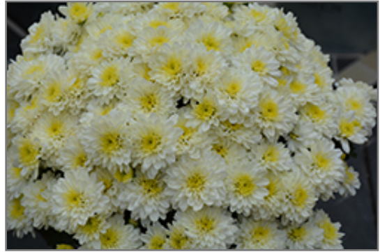
Jacqueline Pearl Chrysanthemum flowers