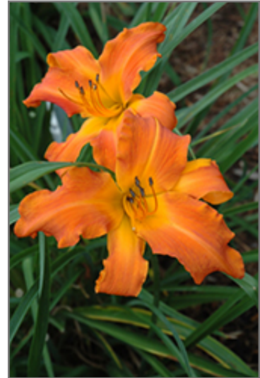
Rainbow Rhythm Primal Scream Daylily flowers