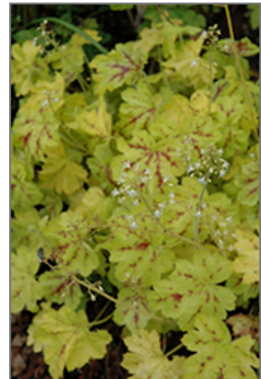
Solar Power Foamy Bells flowers