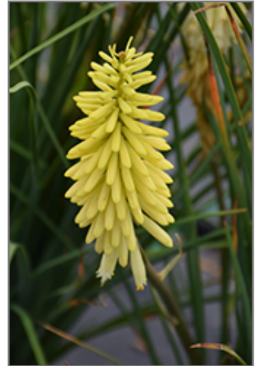
Pineapple Popsicle Torchlily flowers