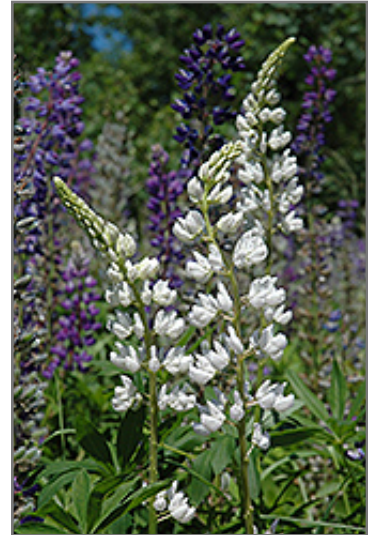
White Lupine flowers