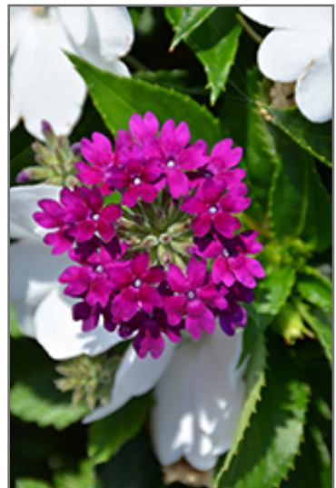
Superbena Royale Plum Wine Verbena flowers