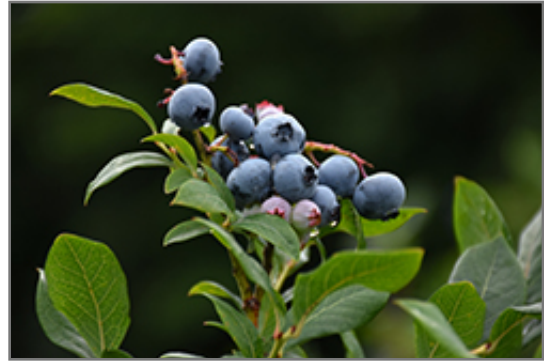
Northland Blueberry fruit