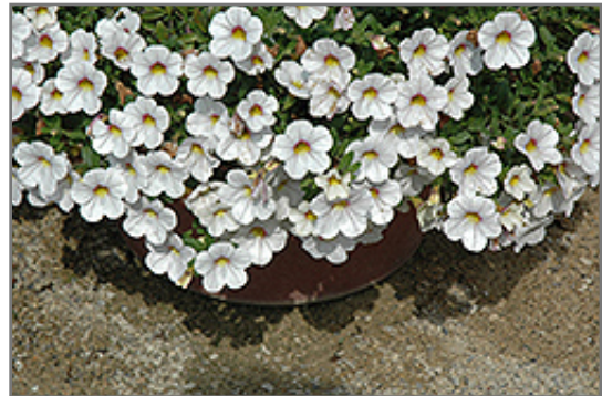
Noa Cherry Blossom Calibrachoa flowers

Noa Cherry Blossom Calibrachoa is recommended for the following landscape applications;