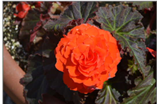
Nonstop Mocca Deep Orange Begonia flowers

Nonstop Mocca Deep Orange Begonia is recommended for the following landscape applications;