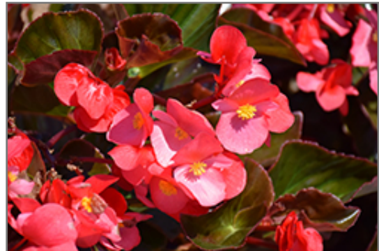
Whopper Rose Bronze Leaf Begonia flowers