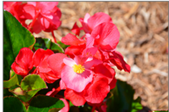
Whopper Rose Green Leaf Begonia flowers

This is a high maintenance plant that will require regular care and upkeep, and usually looks its best without pruning, although it will tolerate pruning. Deer don't particularly care for this plant and will usually leave it alone in favor of tastier treats. Gardeners should be aware of the following characteristic(s) that may warrant special consideration;