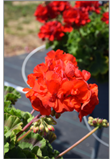
Americana Red Geranium flowers