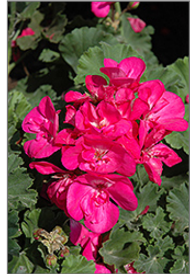
Savannah Blue Geranium flowers

Savannah Blue Geranium will grow to be about 20 inches tall at maturity, with a spread of 20 inches. When grown in masses or used as a bedding plant, individual plants should be spaced approximately 16 inches apart. Its foliage tends to remain dense right to the ground, not requiring facer plants in front. Although it's not a true annual, this fast-growing plant can be expected to behave as an annual in our climate if left outdoors over the winter, usually needing replacement the following year. As such, gardeners should take into consideration that it will perform differently than it would in its native habitat.