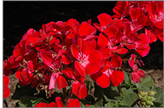
Savannah Ruby Sizzle Geranium flowers