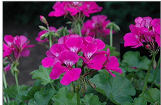
Timeless Lavender Geranium flowers