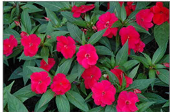
Divine Cherry Red New Guinea Impatiens flowers