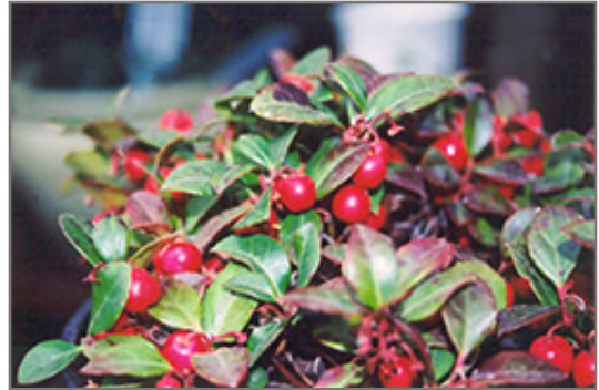
Creeping Wintergreen fruit

Creeping Wintergreen is recommended for the following landscape applications;